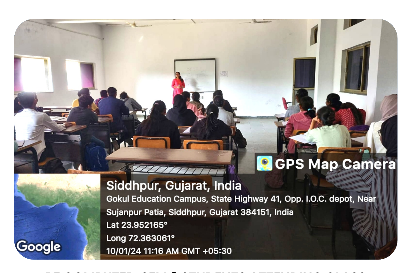
BE COMPUTER SEM 3 STUDENTS ATTENDING CLASS