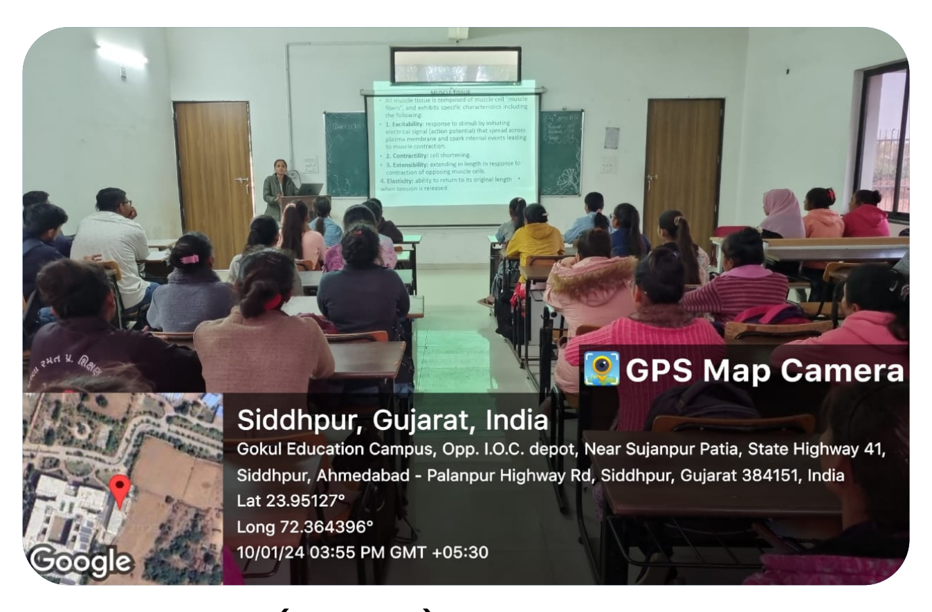
IST YEAR GNM (NURSING) STUDENTS ATTENDING CLASS