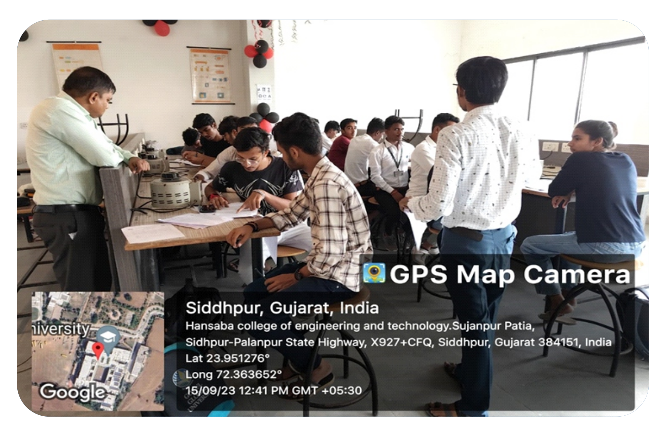
ELE. ENGG. STUDENTS ATTENDING PRACTICAL