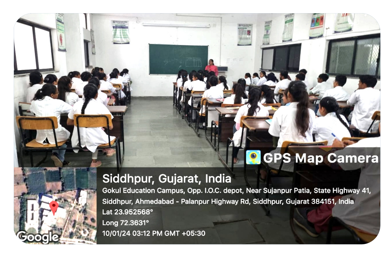
1ST YEAR BAMS STUDENTS ATTENDING CLASS