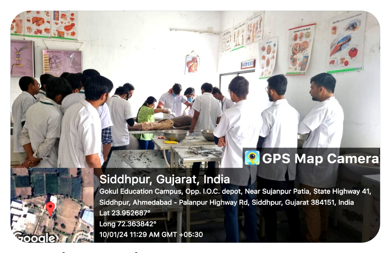
1ST YEAR (OLD BATCH) BHMS STUDENTS ATTENDING PRACTICAL