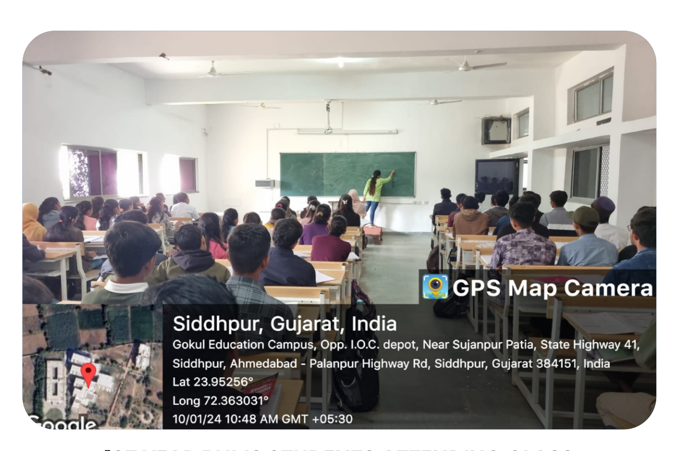
1ST YEAR BHMS STUDENTS ATTENDING CLASS