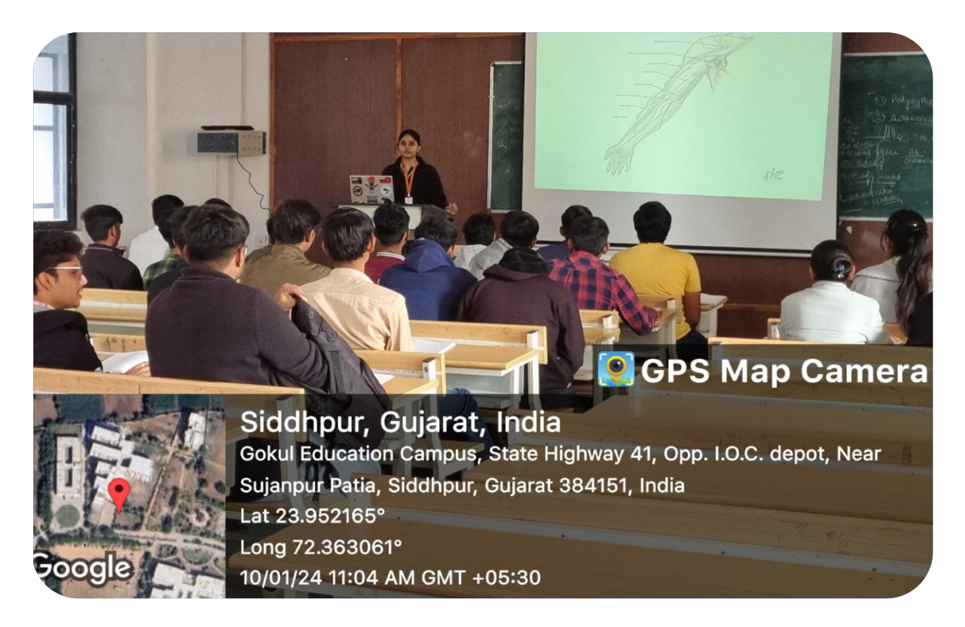
B.PHARM SEM 1 STUDENTS ATTENDING CLASS