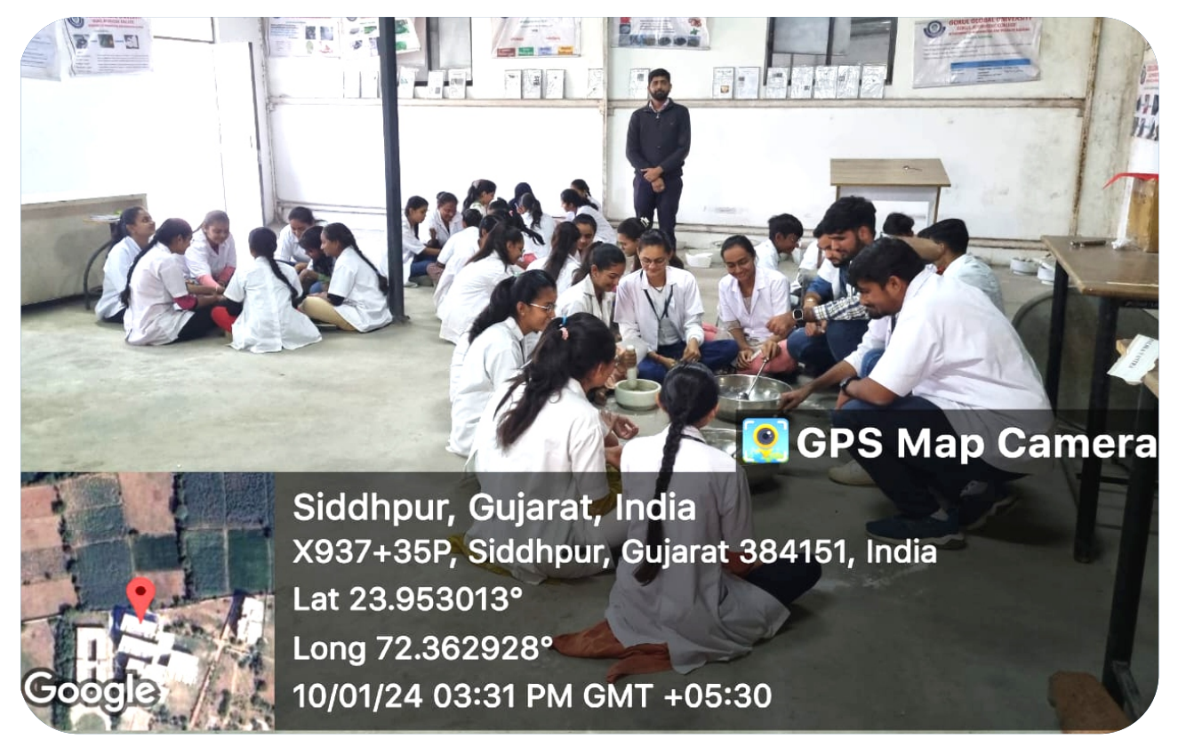
2ND YEAR BAMS STUDENTS ATTENDING PRACTICAL OF RAS SATRA