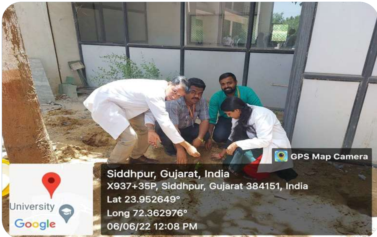
MEDICINAL PLANT CULTIVATION