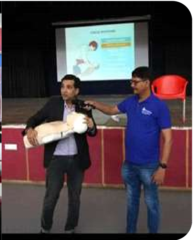
BASIC LIFE SUPPORT TRAINING