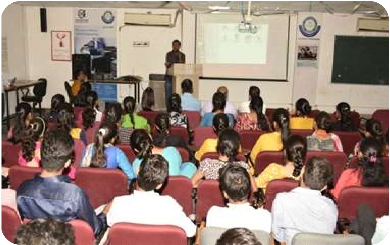
EYE STRAIN AWARENESS