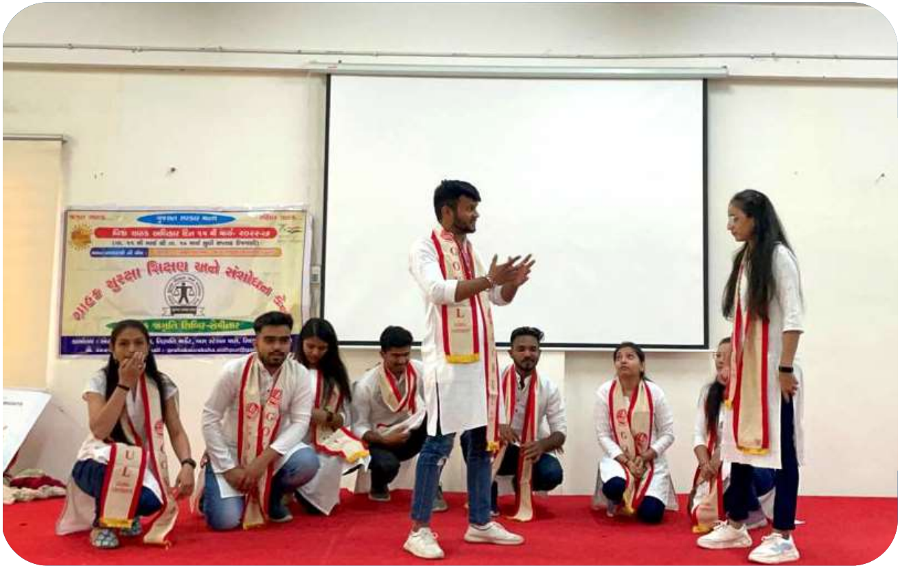
AWARENESS OF CONSUMER PROTECTION (ROLE PLAY)