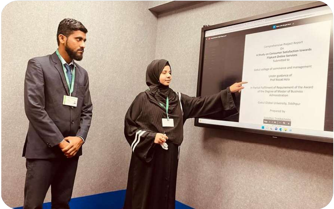
STUDENTS TEAM PRESENTATION