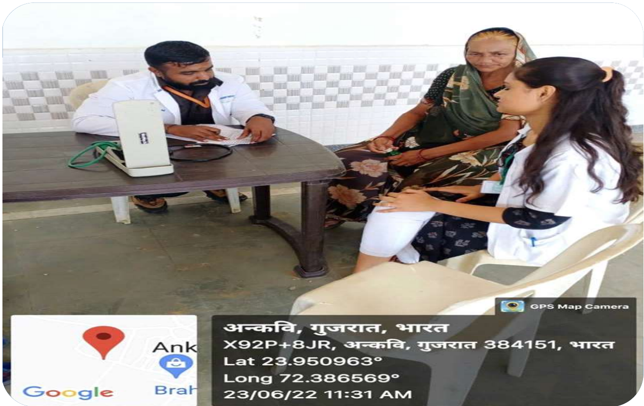
FREE MEDICAL CAMP