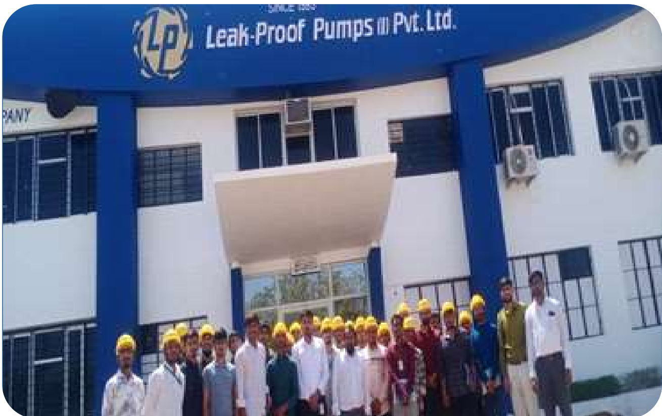
INDUSTRIAL VISIT ON LEAK PROOF PUMP, CHHAPI