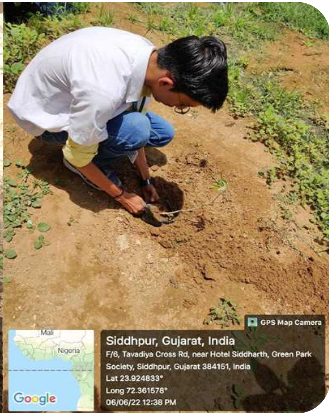
MEDICINAL PLANT CULTIVATION