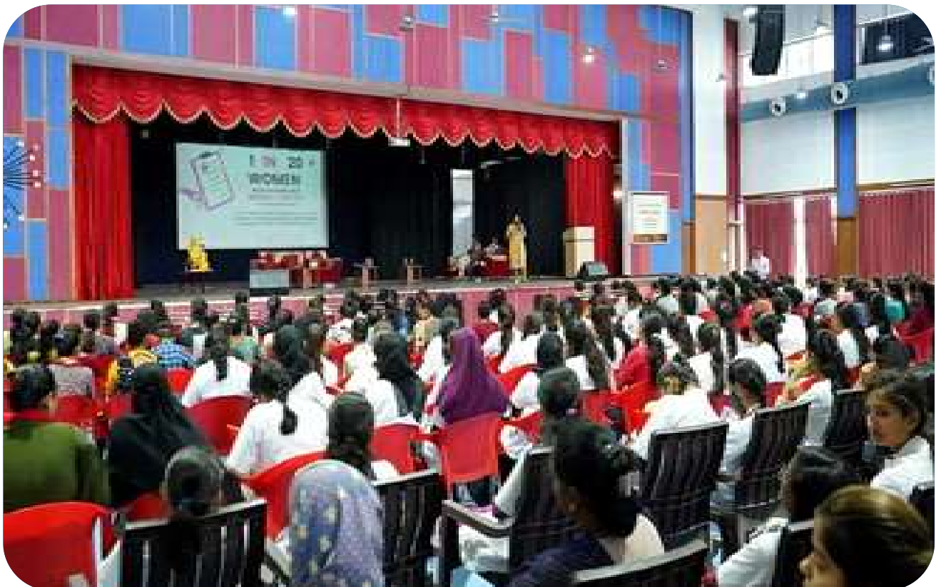
DELIVERING EXPERT LECTURE ON BREAST CANCER AWARENESS