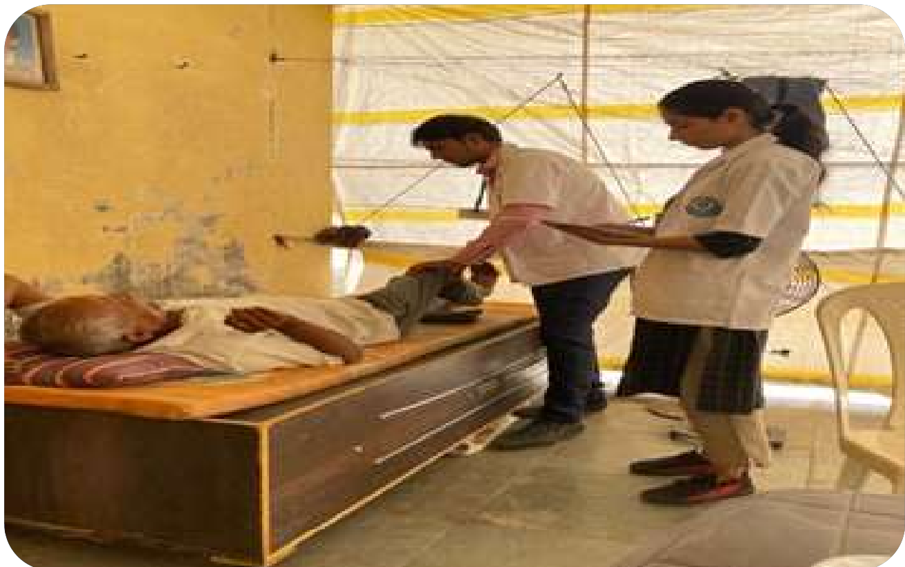
FREE PHYSIOTHERAPY CAMP