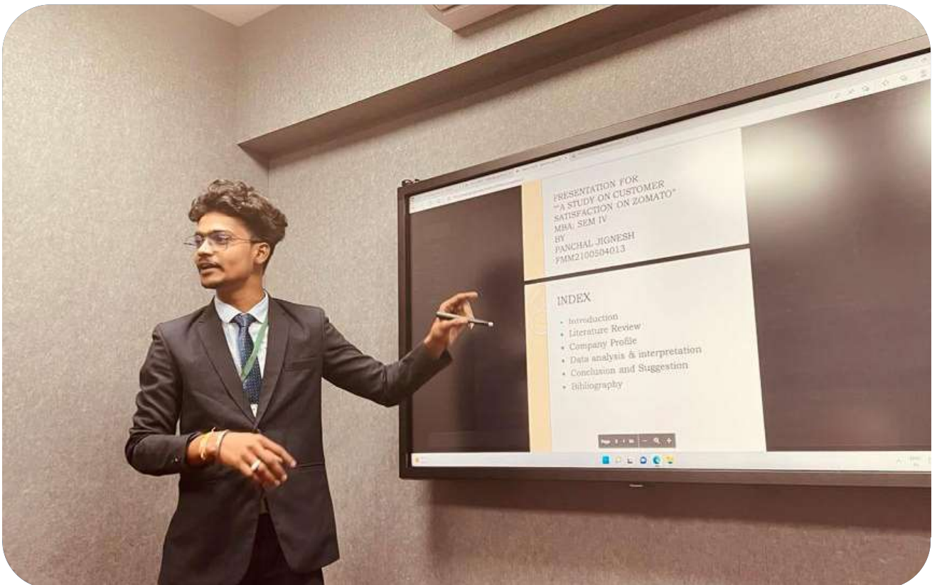
CASE STUDY SOLVED