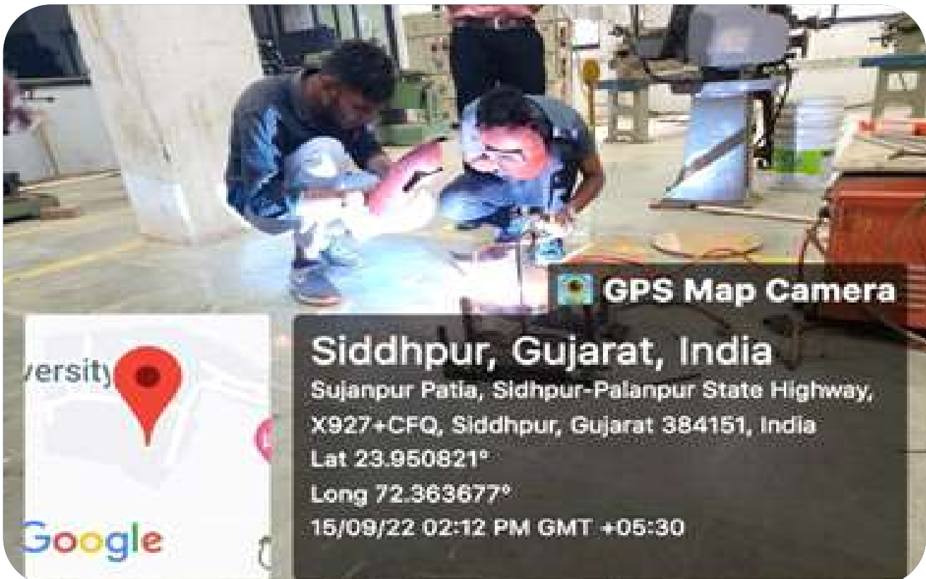
WELDING PROJECT WORK